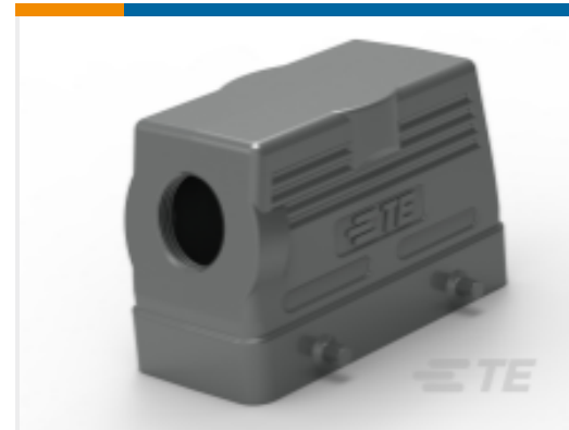
TE Part # T1210160132-000 H16B-TS-M32