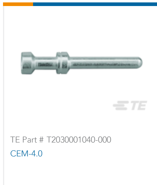
TE Part # T2030001040-000 CEM-4.0