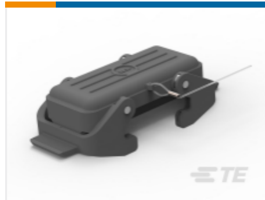
TE Part # T1010241200-000 H24B-KDTP