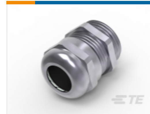
TE Part # T3609320102-000 DLX-32-M