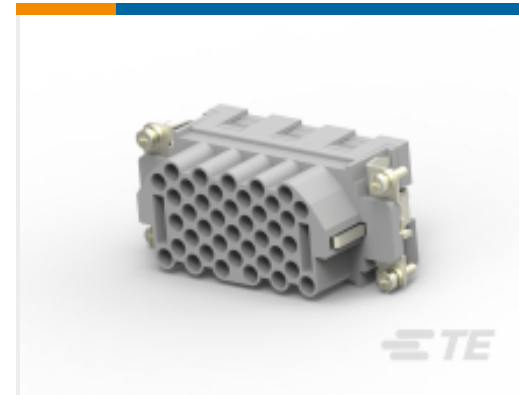
TE Part # T2050402201-007 HEEE-040-F